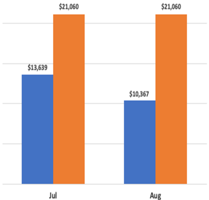
Orangevale Mission Budget (Operating Fund)

Orangevale Church Ministry Donations Received Monthly Donations Needed to cover church expenses